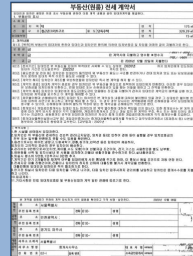
『 Proof of Residence 』

Certificate issued after your arrival in Korea