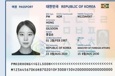
『 Passport copy 』

Front view, full face photo with white background, taken within last 6 months