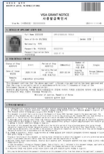
『 Visa 』

Clear copy of the personal information page