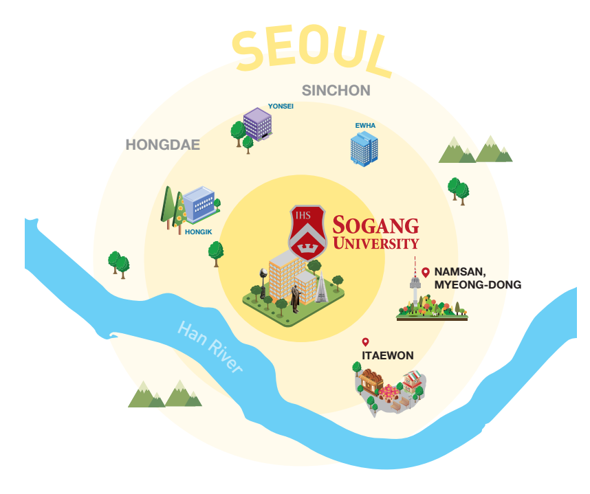
KLEC Teacher Website